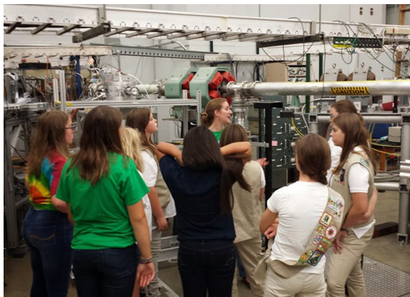
Girl Scouts in the Lab

Contact Information: JINA Outreach, University of Notre Dame, (574) 631-5326, jinaout@nd.edu